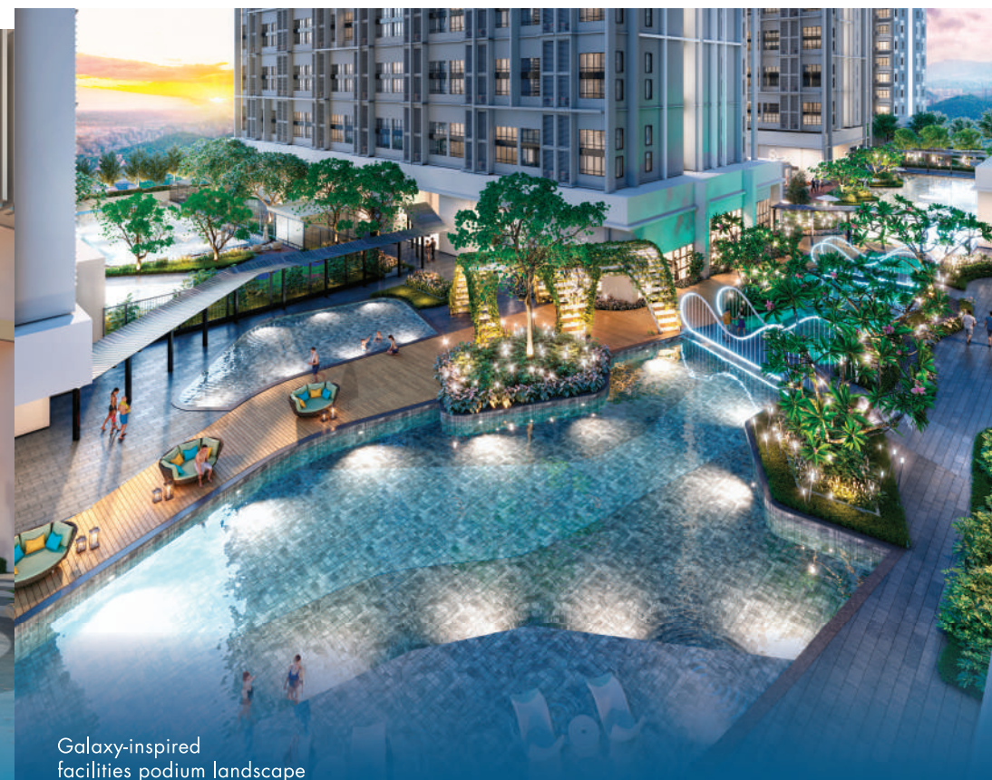
Galaxy-inspired facilities podium landscape

PROXIMITY TO TOP-NOTCH HEALTHCARE CENTRES